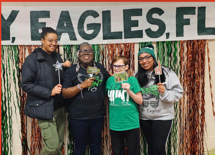
Community Living showed their team spirit by gathering for a Super Bowl Party. They enjoyed tailgate food and games before the main event.