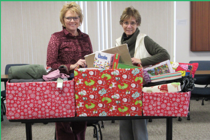
A big thank you to the St. Vincent dePaul Society and the Holy Guardian Angels Parish for sponsoring gifts for Community Living residents, ensuring everyone had a special gift under the tree.